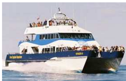
M/V Voyager III

Keep visiting the harbor this winter with Boston's Best Cruises!