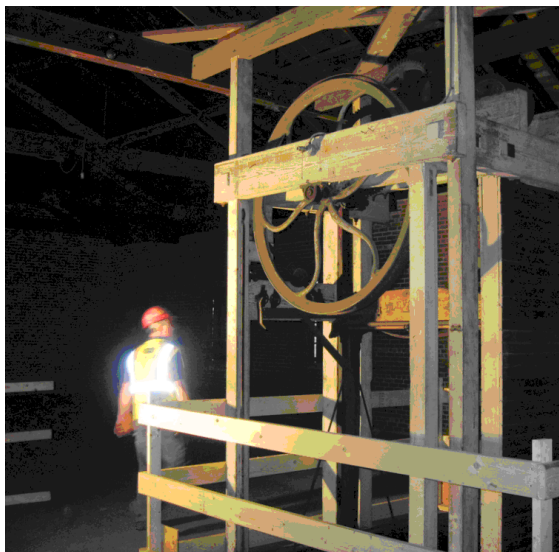
Elevator in the industrial building

CLICK HERE FOR PEDDOCKS CONSTRUCTION INFO