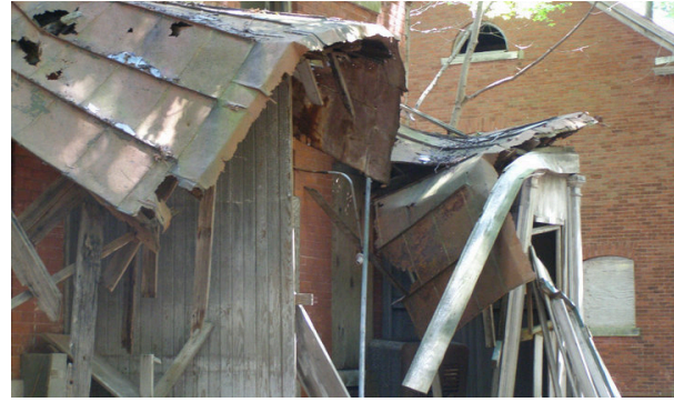
Peddocks Island Church

Funds for the project have come from the Natural Gas Mitigation Fund and the State DCR.