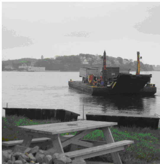
Barging equipment to the island