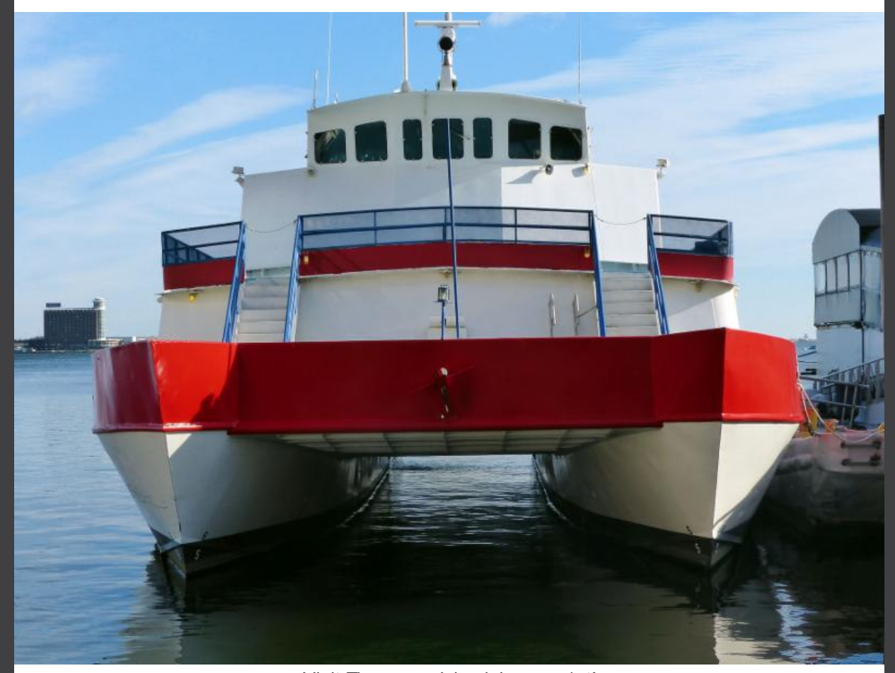
Visit Thompson Island January 1st!

Start the New Year on the Right Foot! Explore Thompson Island with the Friends Walks, Birding, Yoga* (*for an additional fee)