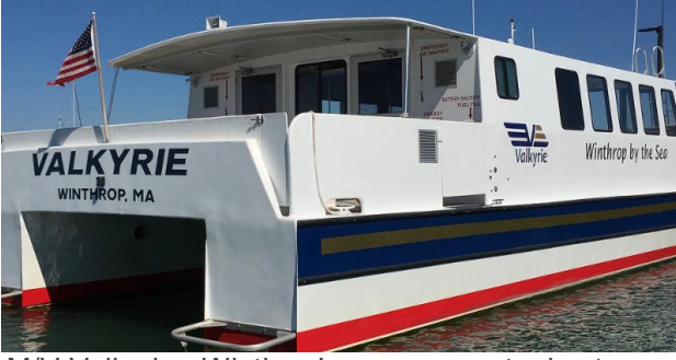
M/V Valkyrie - Winthrop's new commuter boat, now operating from Marina Bay, Quincy to Rowes Wharf & Spectacle Island as well as Winthrop!

NEW FERRY SERVICE from Marina Bay, Quincy to Spectacle Island, Winthrop & Rowes Wharf onboard the M/V Valkaree! <u>SCHEDULE CLICK HERE.</u> (FBHI membership discount does not apply to this service)