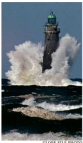
GLOBE FILE PHOTO