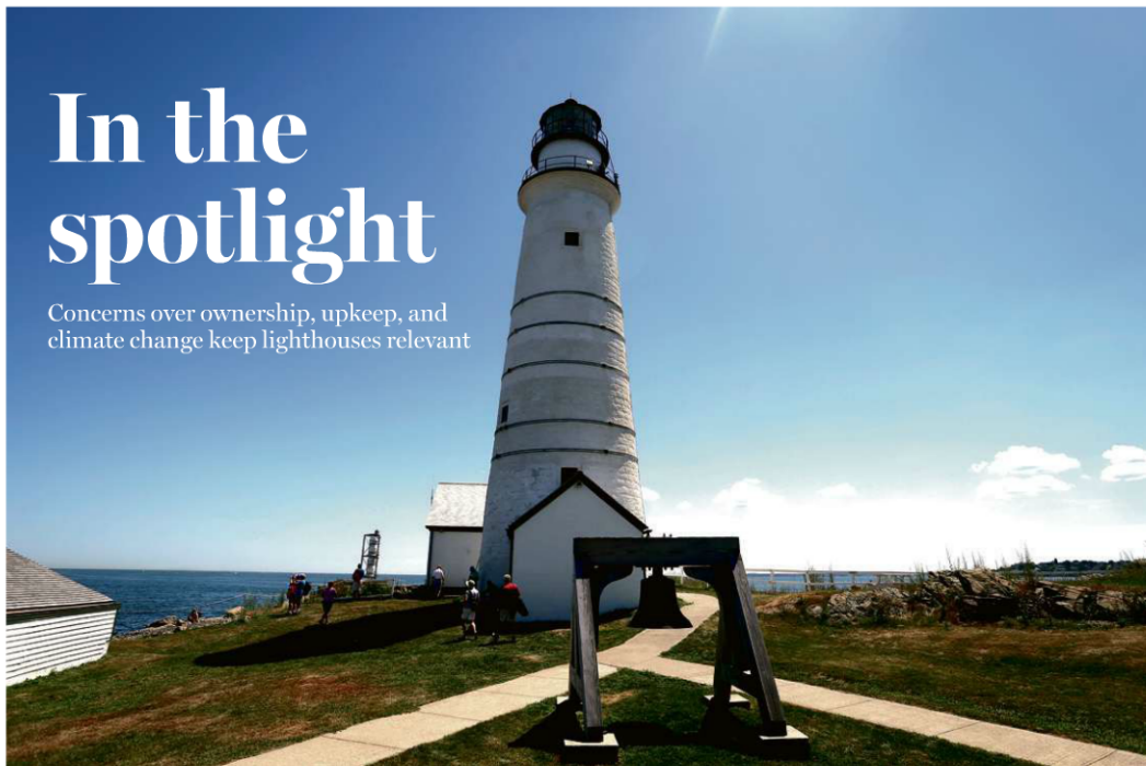
September marks the 300th anniversary of Boston Light on Little Brewster Island.

Concerns over ownership, upkeep, and climate change keep lighthouses relevant