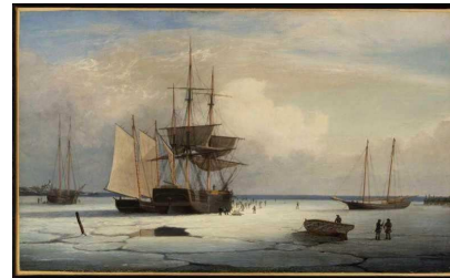
Fitz Hugh Lane, Ten Pound Island, Gloucester 1950's