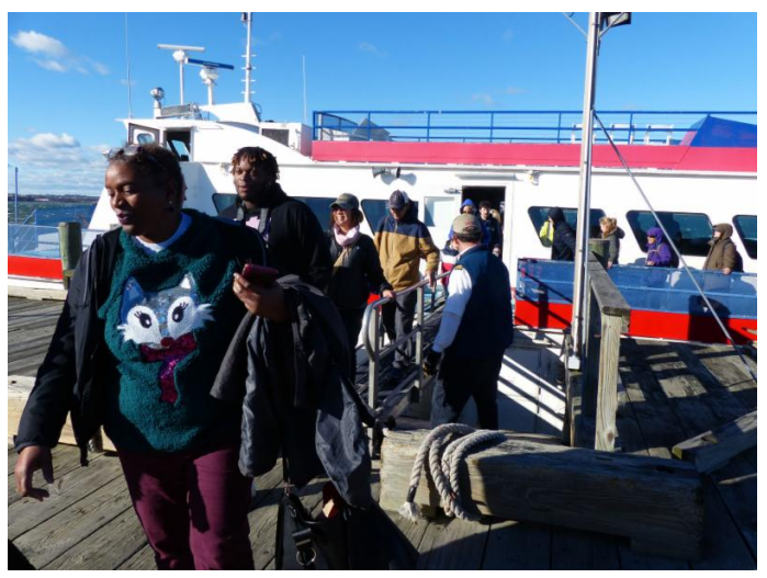
Disembarking from the boat onto

We had special guests -- a Boston Globe reporter and a writer. Read the article in <u>the Boston Globe.</u>