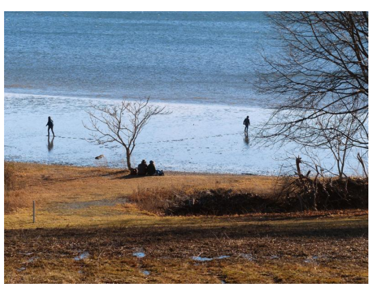
Visitors were reward with spectacular views.