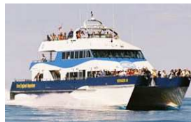
M/V Voyager III

or click on http://fbhi.org/store---books.html Check out our other books that'll make for great gifts as well