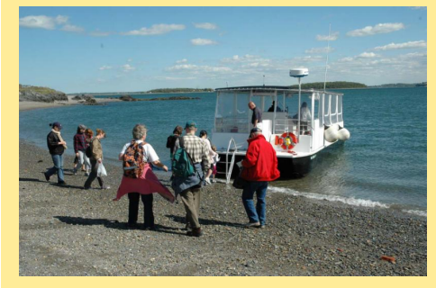
Catching the boat on Rainsford Island

October 11 Rainsford, 10 a.m.to 2:00 p.m. Island Expeditions with Rowes Wharf Water Transport