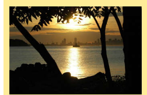
Take a sunset boat ride on June 25, July 9, July 23 and Aug. 20 and see the harbor islands in a new light.

June 22 Great Brewster, noon-5:00p.m. Leave from Rowes Wharf Water Transport,Boston.