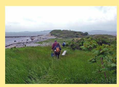
Visit Great Brewster Island June 22 and Sept. 20