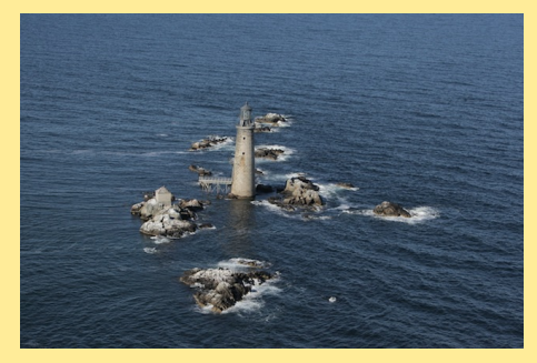
See Graves Light on July 18, Aug. 8 and Sept. 12 with a lighthouse tour.

August 6 Mystery Island sunset: Details to come