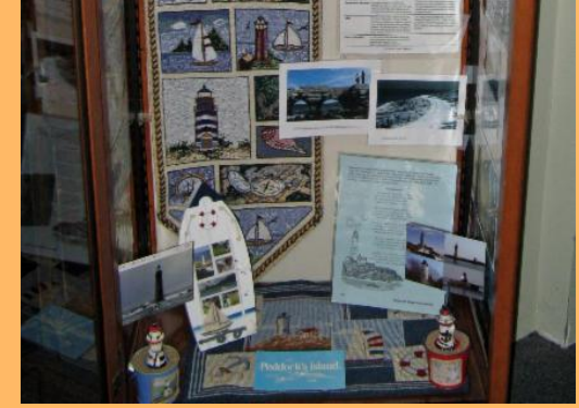
Chatham Library Display on the Harbor Islands by Kevin Rogers