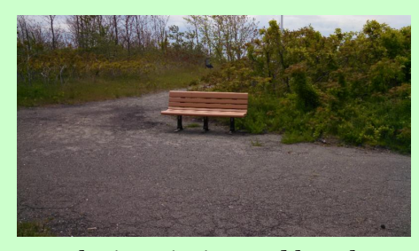
The inscription and bench dedicated to John Forbes