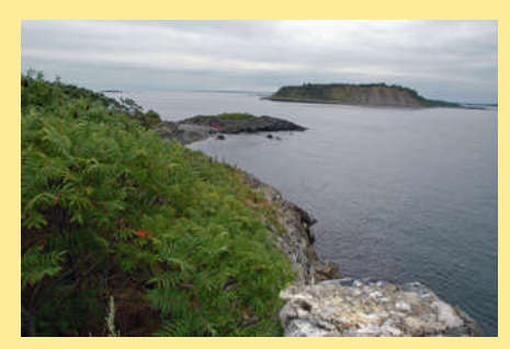
The view from Calf Island toward Great Brewster.

July 9 Long Island sunset, 6 to 9 p.m. Leave from Rowes Wharf Water Transport, Boston.