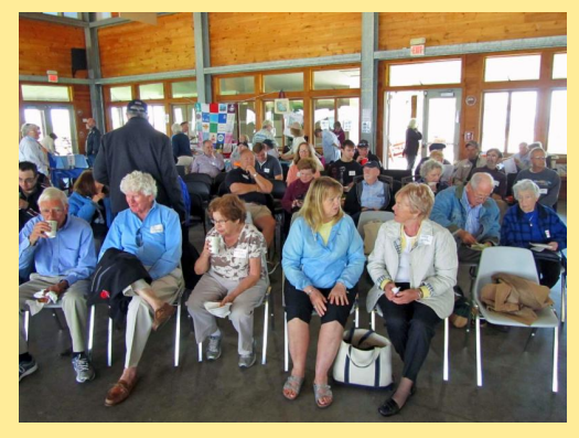
Friends met friends at the annual meeting