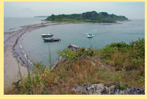
Visit Rainsford Island on October 11

Island Expedition: Adult $30.00; FBHI member, Senior (65+) and Student with current ID $27.00; Child(under 12) $22.00; FBHI child member $20.00.