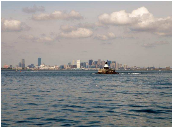
PHOTO: On the way to Little Brewster, looking back at Boston, with the stone Nixes Mate day marker in the midground

PHOTO: Here's the view from the top of the lighthouse, looking back towards Boston. As you can see, Little Brewster Island deserves its name: It's tiny!