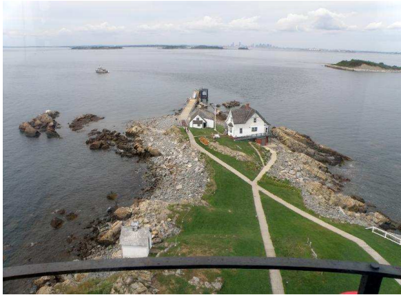
PHOTO: Here's the view from the top of the lighthouse, looking back towards Boston. As you can see, Little Brewster Island deserves its name: It's tiny!

PHOTO: This rotating assembly slowly spins the lighthouse lenses, which are in the room above.