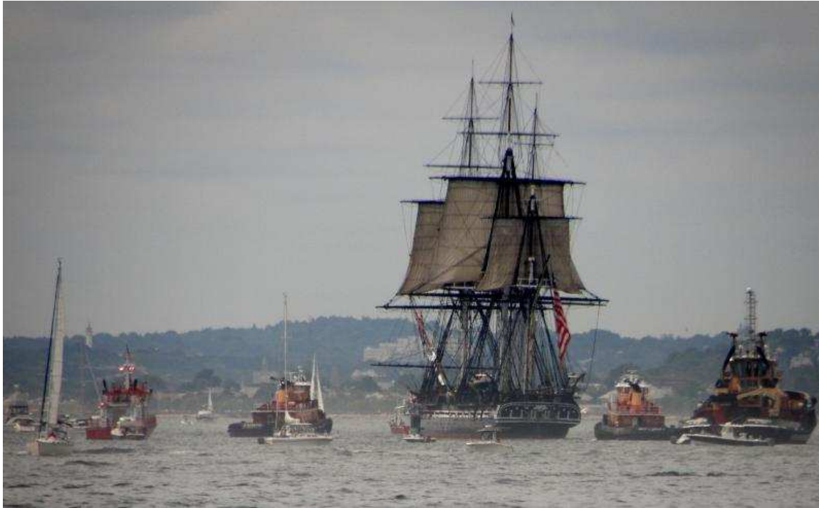
PHOTO: Not something you see every day --- a 215-year-old warship sailing under its own power through the waters of Boston Harbor. Spectacular!