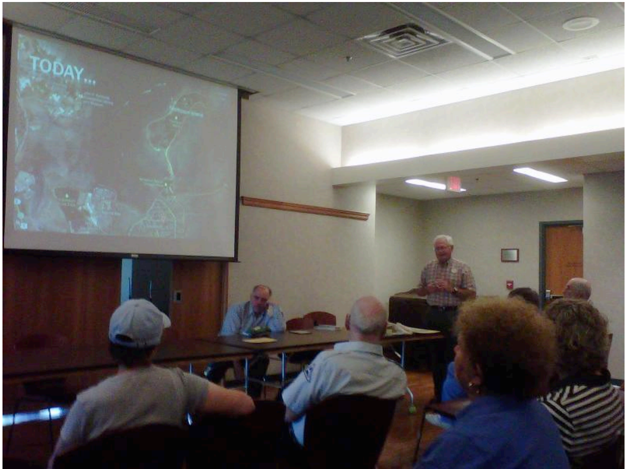
Freedom 75 discussion July 28th, 2011