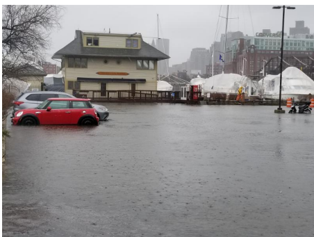
Jan 4, 2018 flooded Constitution Marina parking lot, 1st of 2 "100 year" storms!