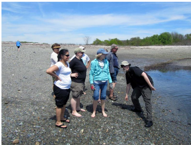
Graves Light and Boston Light. Learn more & buy tickets HERE